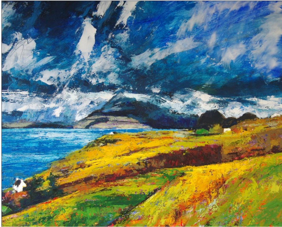
Driving Down to Elgol oil on board, 24" x 30" £1250