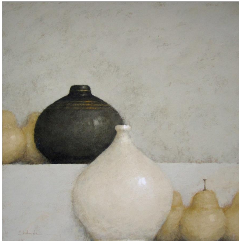
Painting 235 acrylic on board, 15" x 15" £1300