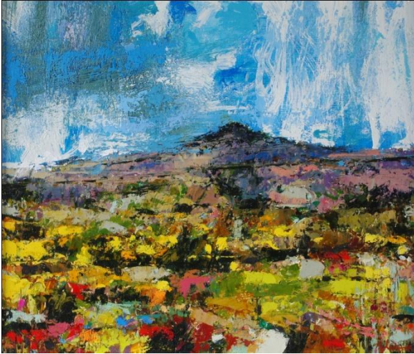
September Walk to Hannibal's Carn oil on board, 12" x 14" £625