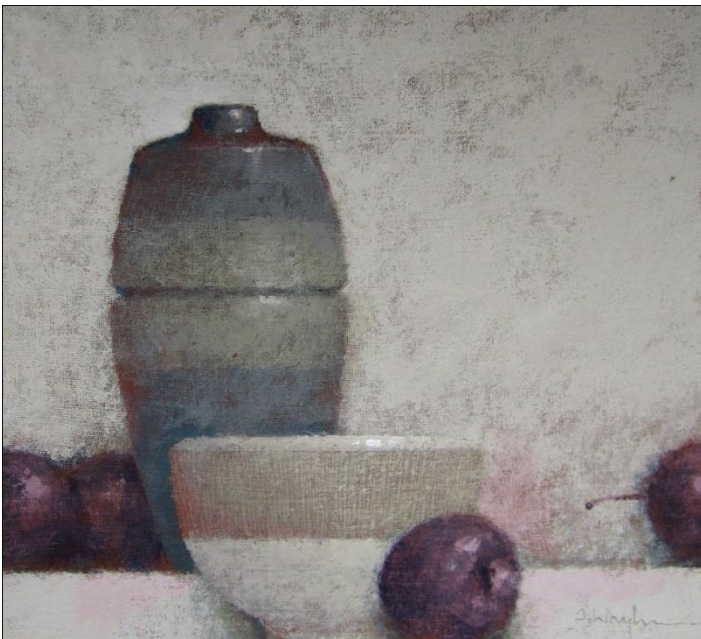
Painting 1711 acrylic on board, 9" x 10" £600