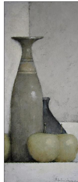
Painting 126 acrylic on board, 15" x 6" £600