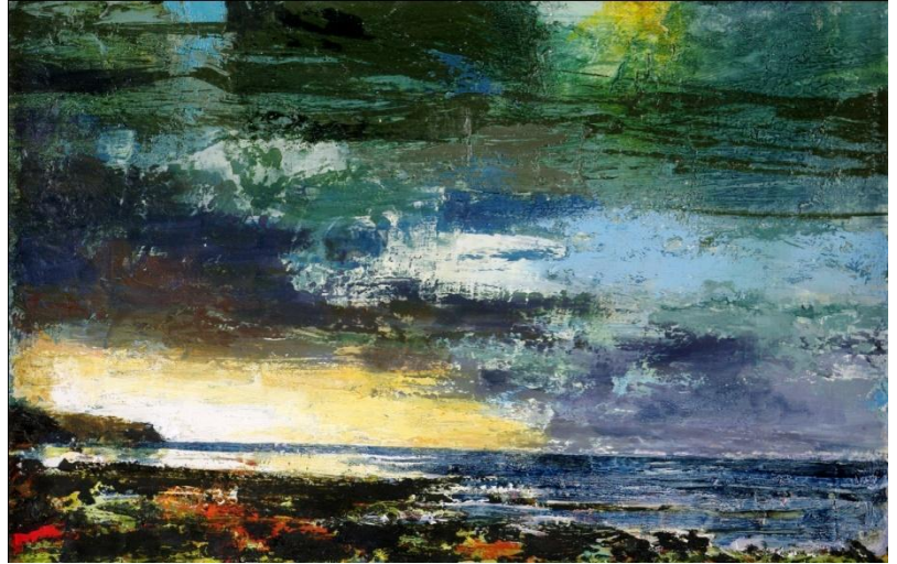
Sunset, Tide Turning oil on board, 7½" x 11½" £450