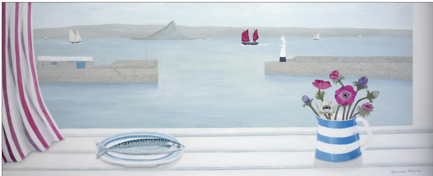
Cornish Anemones and View Across Mounts Bay acrylic on canvas, 20" x 48" £850