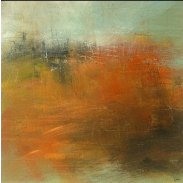
Autumn acrylic on canvas, 20" x 20" £400