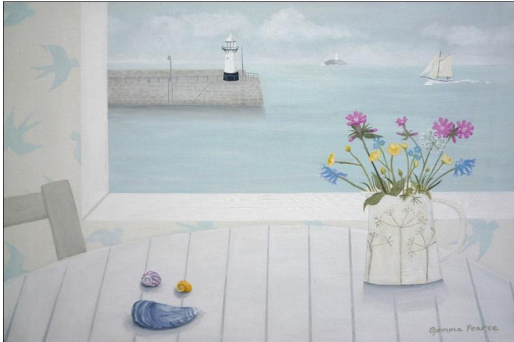
Cornish Wildflowers and Shells – St Ives acrylic on canvas, 16" x 24" £595