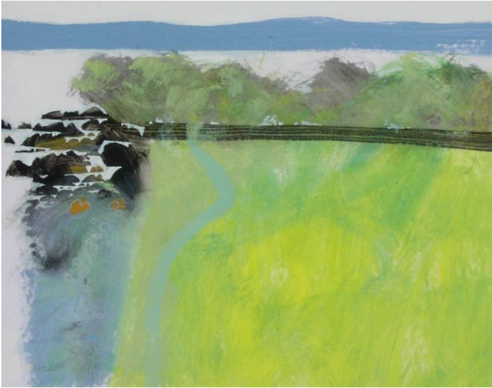
West from Perranuthnoe mixed media on board, 10" x 12" £450