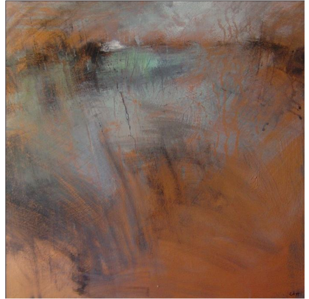
Coastal Breeze acrylic on canvas, 20" x 20" £400

Front cover: Passing the Tamarisk Hedge , Simon Pooley , mixed media on board, 10" x 12", £450