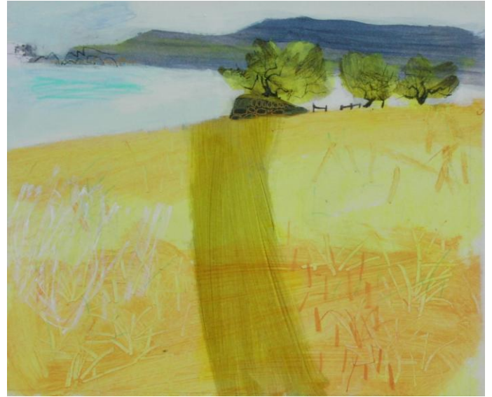
Meadow Walk to Perranuthnoe mixed media on board, 10" x 12" £450