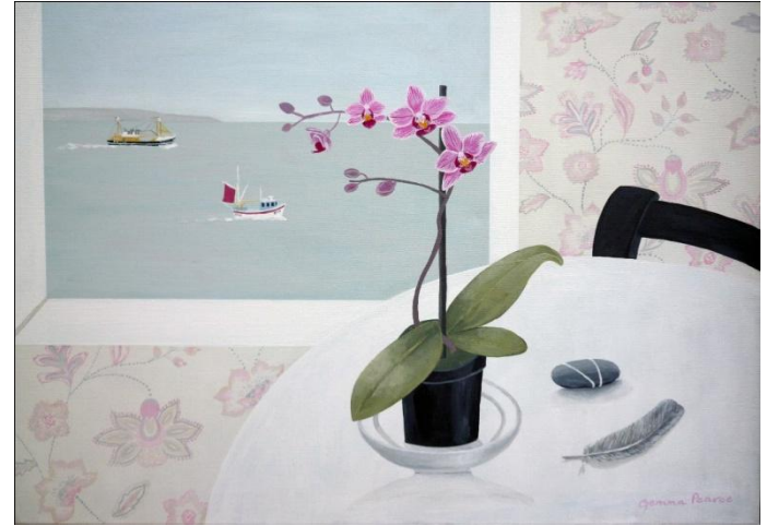
View Across to the Lizard acrylic on canvas, 20" x 28" £650