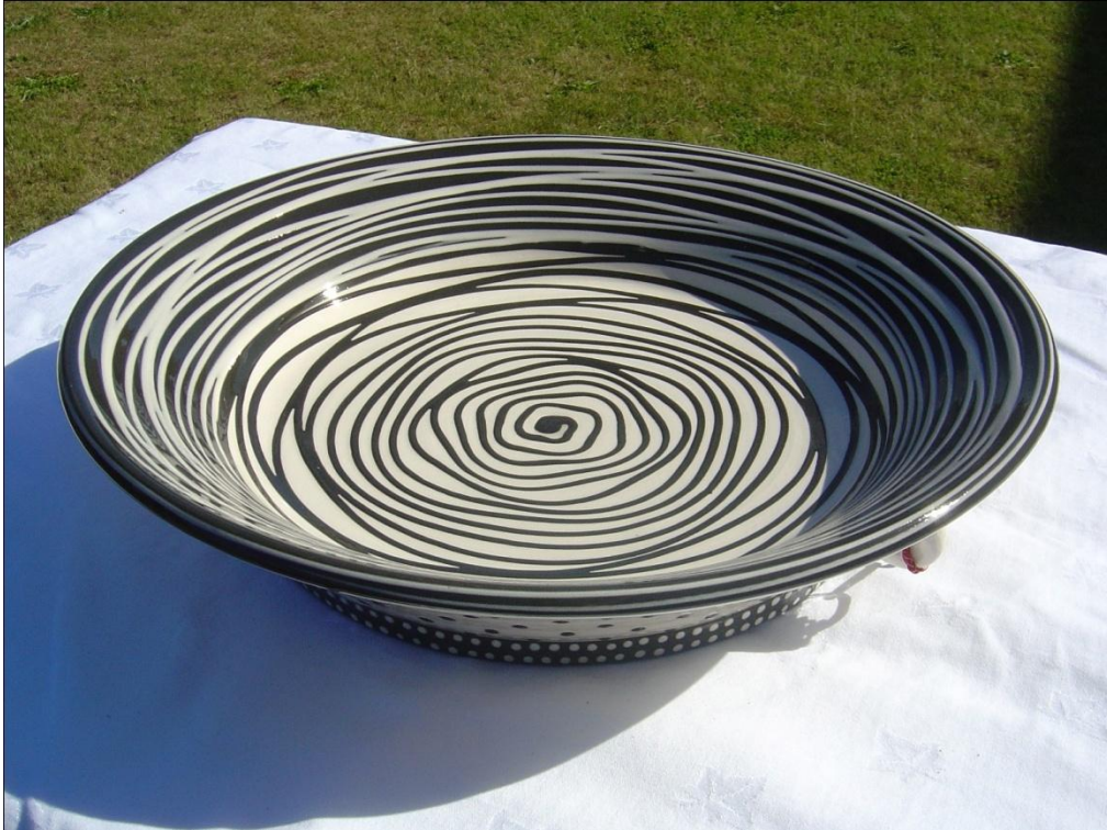
Wall plate 18" diameter £320