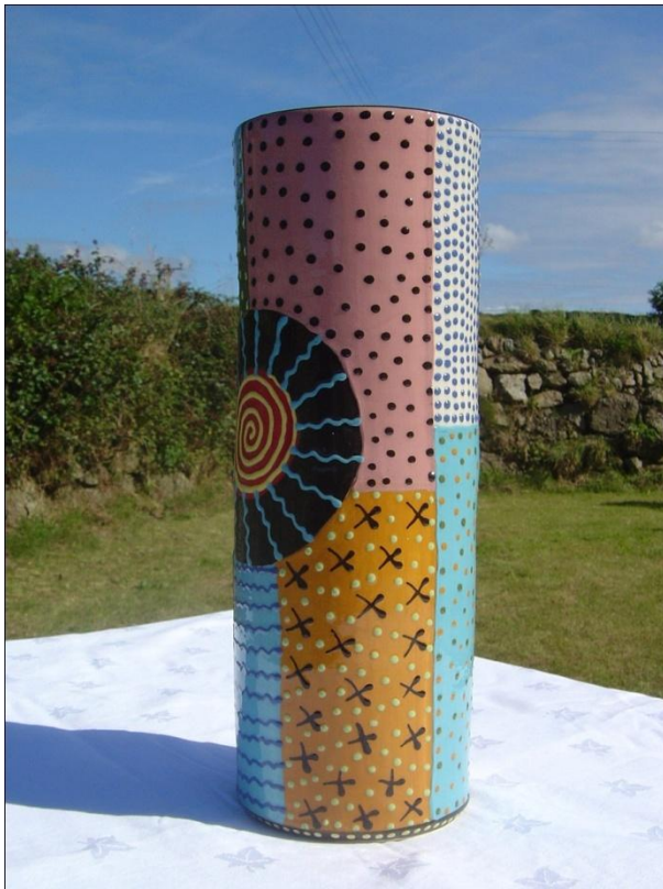
Tall Vase, Lincoln Kirby Bell, 15" tall, £290