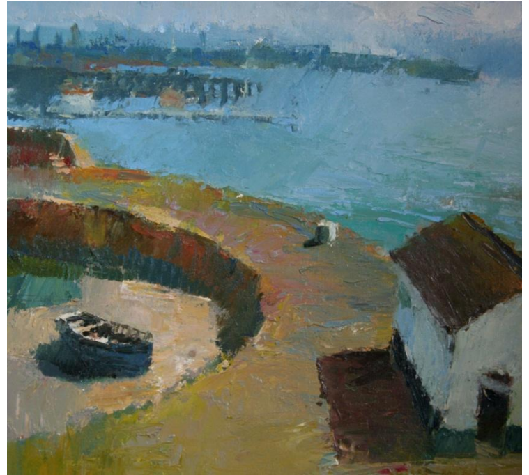
Newlyn Harbour Old Quay Neil Pinkett Oil on board, 16" x 20", £1790