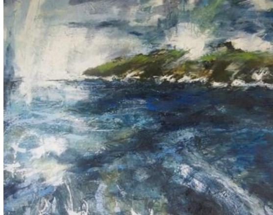
Storm Blowing In Over The Headland