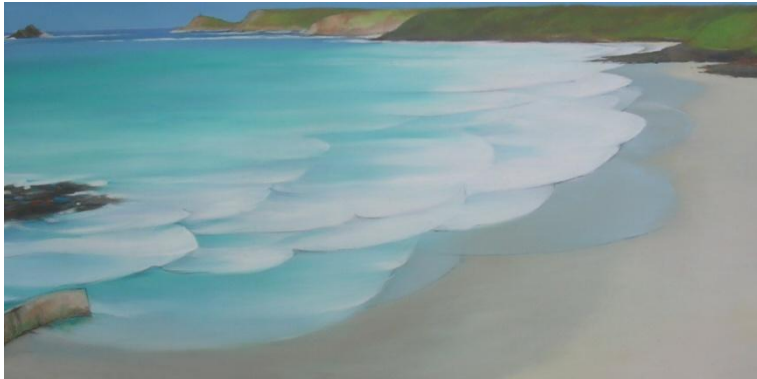
Low Spring Tide, Whitesand Bay, Sennen