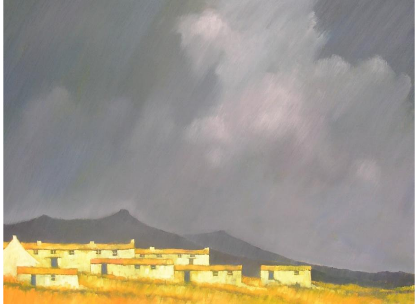
Moorland Hamlet John Piper Oil on canvas, 30" x 40", £3000