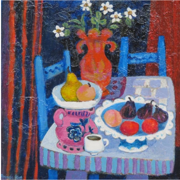
Table Top With Two Blue Chairs