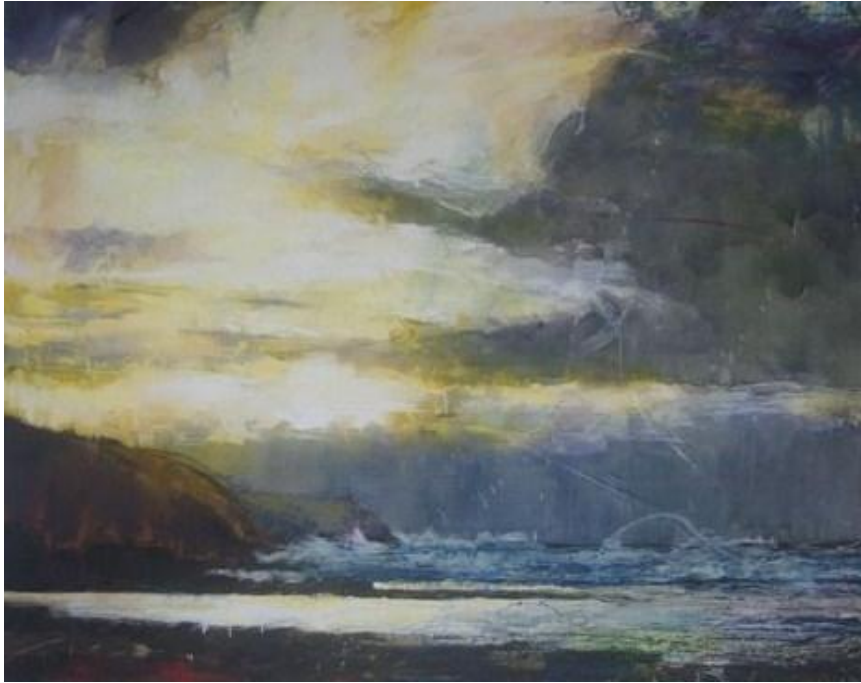
A Wild Winter's Day at Perranporth