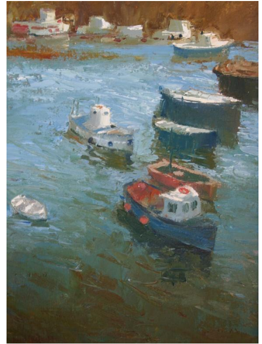
Newlyn Old Harbour