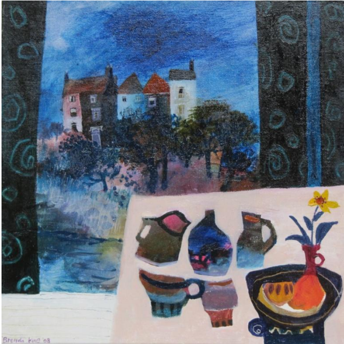
December Colour Brenda King Oil on canvas, 12" x 12", £700