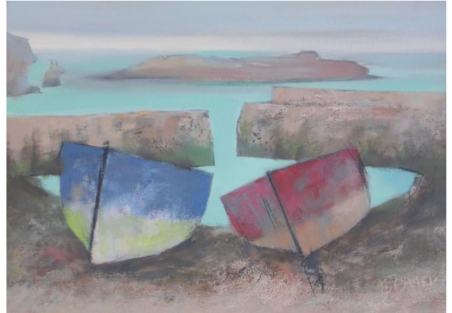
Hull Shapes, Mullion