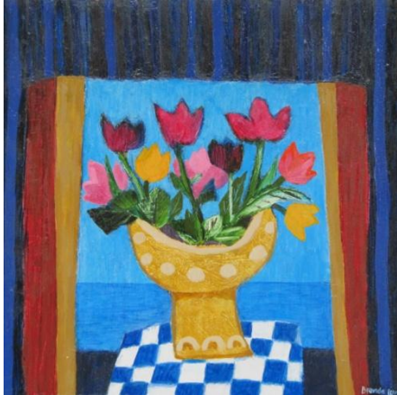
Tulips By The Sea