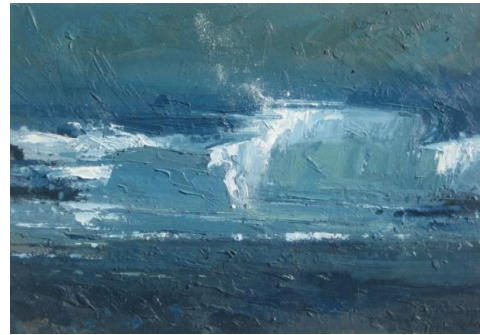
Wave, St Loy's Cove