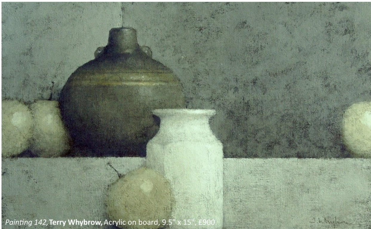
Painting 142, Terry Whybrow, Acrylic on board, 9.5" x 15", £900