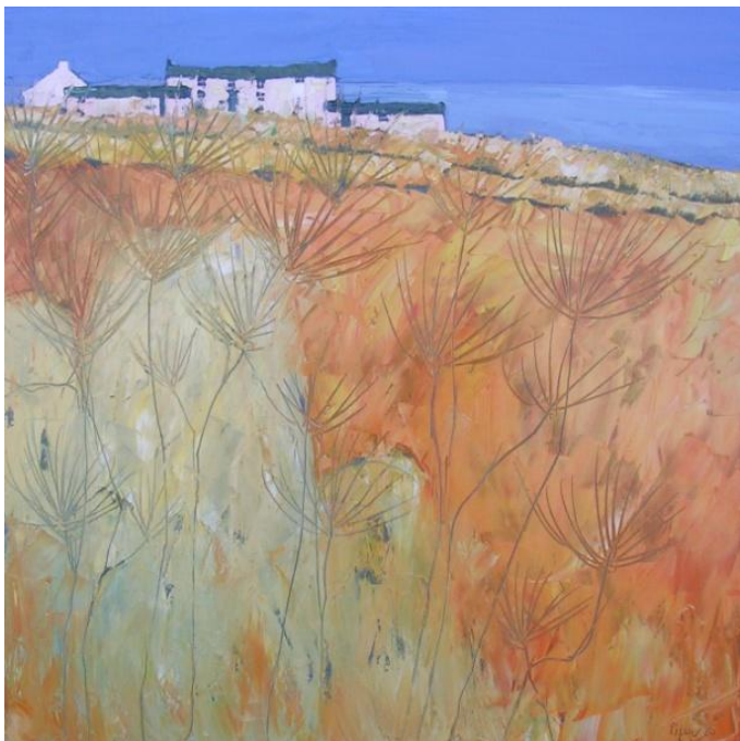
Summer Coast , John Piper Oil on canvas, 32" x 32", £2500

Please join us for a drink at our Private View on Wednesday 5 th May, 2010, 6pm-9pm at 54 The Gallery, Shepherd Market, Mayfair, London.