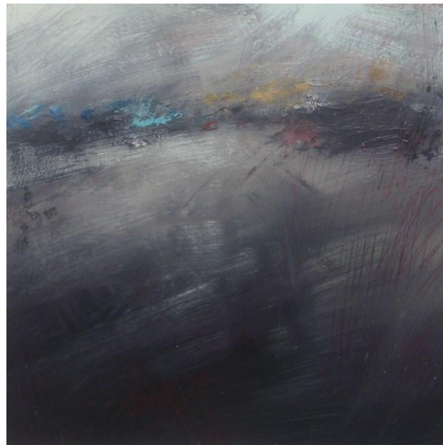
Calm Still Ben Catt Mixed media on board, 20" x 20", £495