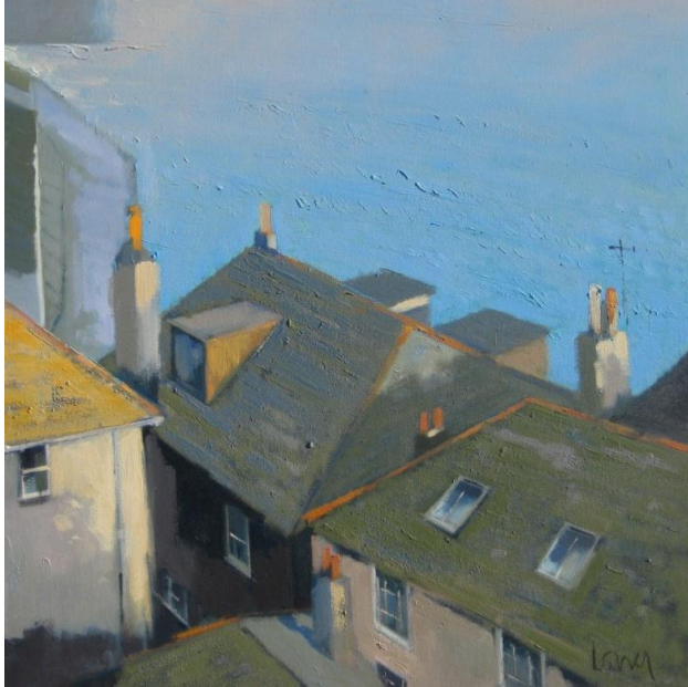
St Ives Rooftops Gary Long Oil, 24" x 24", £1500