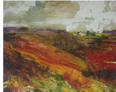
Bracing Winter Walk Round Treen