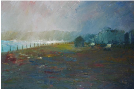
Penzance Promenade Wind and Sun