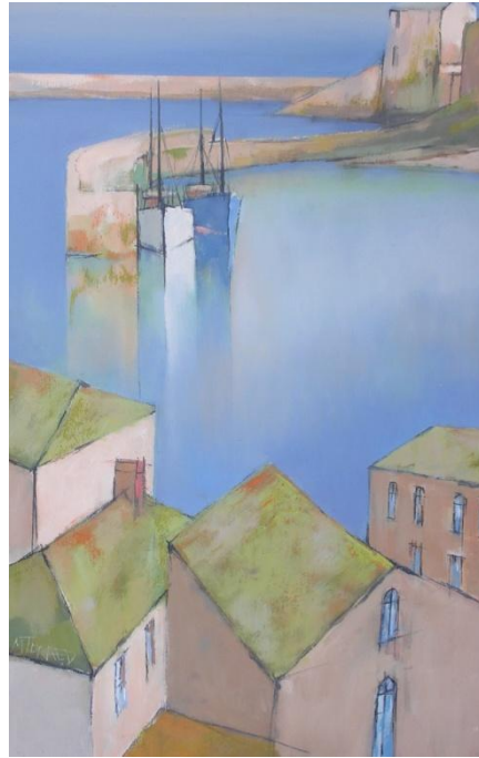
The Inner Harbour